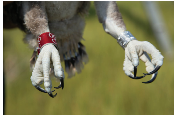
Image: Osprey legs with bands. The codes on the bands are unique to each bird.

http://www.nhnature.org/programs/project_ospreytrack/osprey_maps.php