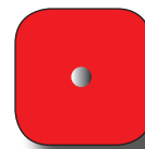
Set of toes and talons for one leg

The number can only result in a body part being drawn if it can be added to a part already present. For example throwing a 3 for an eye is no good if the Osprey has not already got a head.